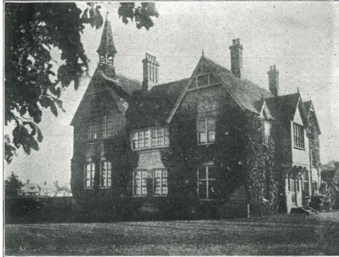
The School from N.W.