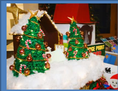
Christmas Hampers for Alford Day Centre

East Lindsey Children's Centre would like to draw your attention to their programme of Christmas activities in the area, copy attached.