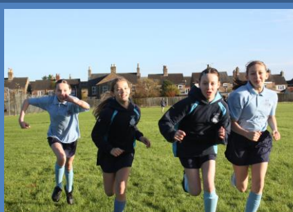
1000 Lap Challenge Sponsor Walk/Run