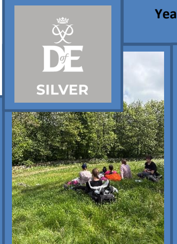
Year 10 Silver Duke of Edinburgh practice expedition in the Peak District

commendable. Now on to the assessed weekend ... !!